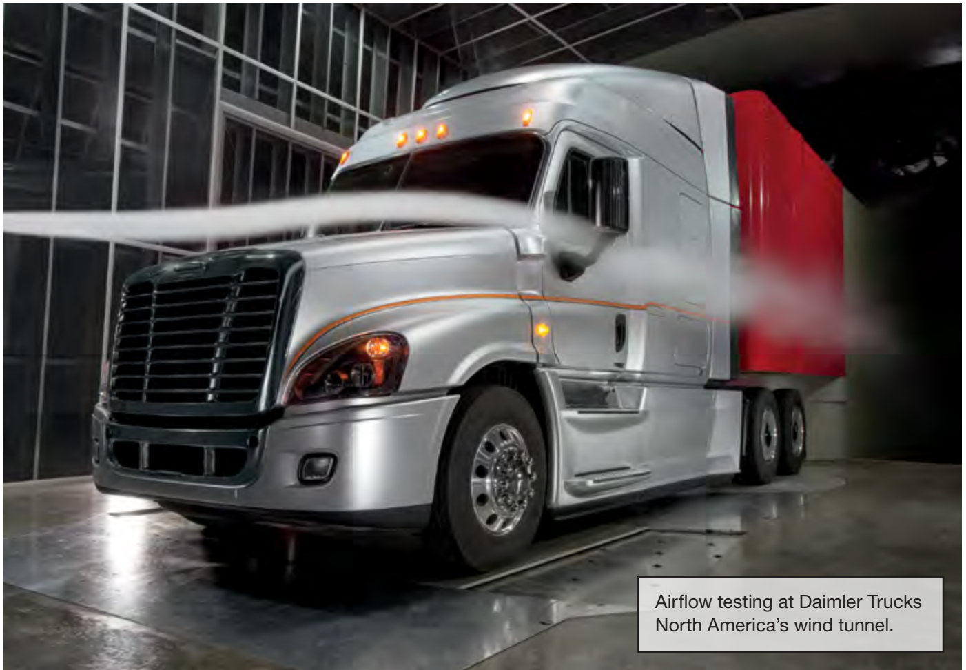
Airflow testing at Daimler Trucks North America's wind tunnel.

You might not have access to a wind tunnel, but a visual inspection of your truck will likely turn up areas for savings. Cabs and trailers are different heights and widths, so making sure the angles of side extensions, fairings and spoilers are correctly designed so air passes around the trailer can add as much as 10% to fuel efficiency. Chassis side fairings can improve fuel economy up to 3% and cab side extenders up to another 3%. Don't forget to minimize your trailer air gap as much as possible during the spec'ing process—36 to 48 inches is optimal.